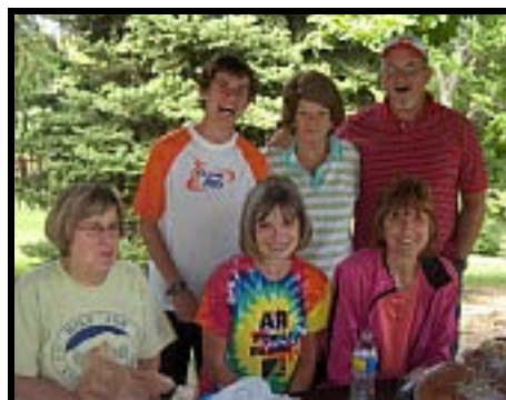
Waiting for the food