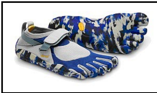
Vibram “FiveFingers KSO”

“Many times I’ll go on grass and do drills in ‘em,” he says. “I don’t wear ‘em running... I believe in balance.”